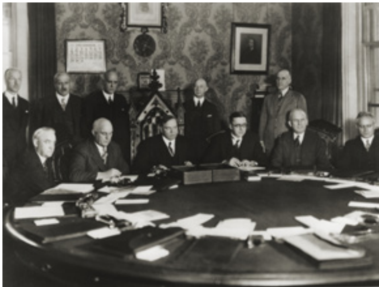
On December 14, 1929 Prime Minister Mackenzie King (in ornate chair) and Premier John E. Brownlee (to his left) concluded negotiations to execute the Natural Resources Transfer Agreement which gave Alberta control over its public lands.