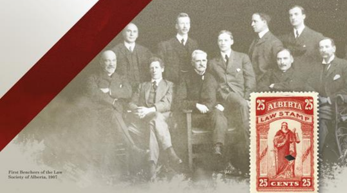
First Members of the Law Society of Alberta, 1907.