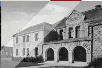
The Old Court House, Calgary, Alberta