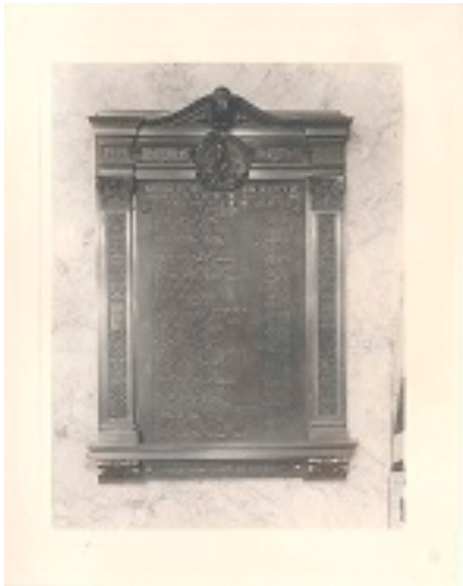
Memorial plaque honouring WWI veterans, Edmonton Courthouse.