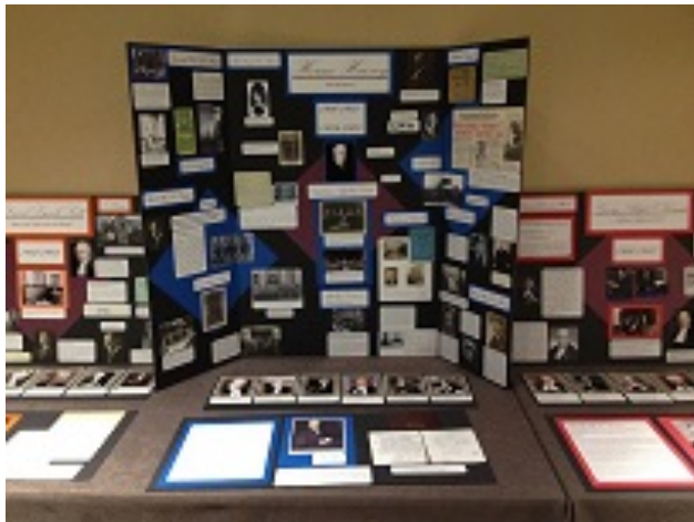
LASA's Display Commemorating Court of Appeal's Centennial, Edmonton, April 10, 2014.