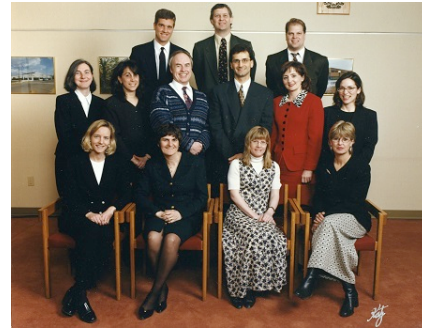
Edmonton Bar Association, Executive, 1996 Accession #: 2014-005

financial statements, some EBA correspondence, and memorabilia from events hosted by the EBA. Three photo albums include members of the Edmonton Bench and Bar in attendance at EBA dinners. Seven over-sized prints depict Edmonton Bar Association board of directors, 1989-1997. Nine banker boxes of non-archival financial records were returned at the request of the donor.