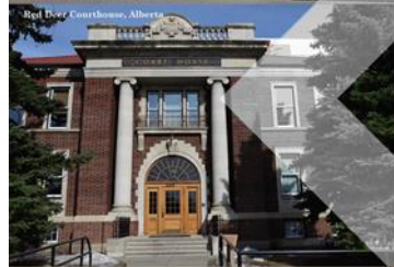
Red Deer Courthouse, Alberta