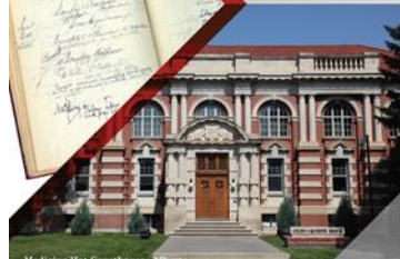
Medicine Hat Courthouse, Alberta