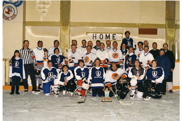
Female Lawyers vs. Judges Hockey Team, ca. 1996 Accession #: 2014-003