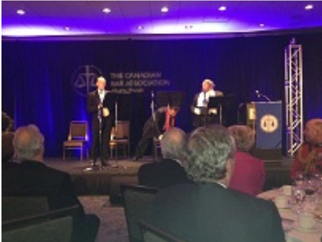
The Three Ten(s)ors Performing, Edmonton Court of Appeal Dinner, April 10, 2014.