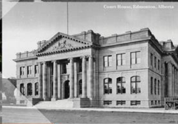
Court House, Edmonton, Alberta