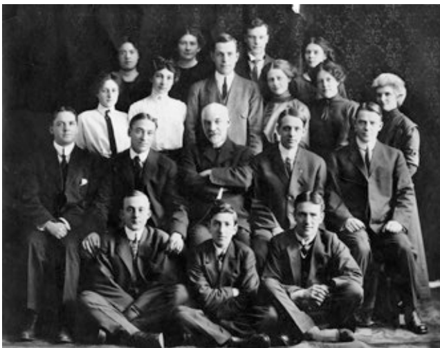
Original Macleod Dixon firm 1912