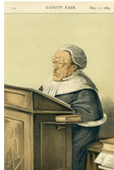
Vanity Fair Judges. Donated by McCuaig Desrochers LLP.