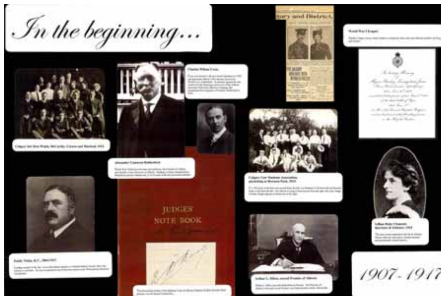
LASA Decades Display Board, 1907-1917 Featured at Law Society Gala Dinner, October 4 th , 2007

LASA acquired 35 accessions in 2007, amounting to nearly 14.26 linear metres of textual records, over 62 photographs, 9 videos, 3 cultural historic items (wooden case, mallet and trowel), and 9 textiles (judicial apparel). Currently LASA's holdings exceed 550 metres. Noteworthy acquisitions in 2006 include: