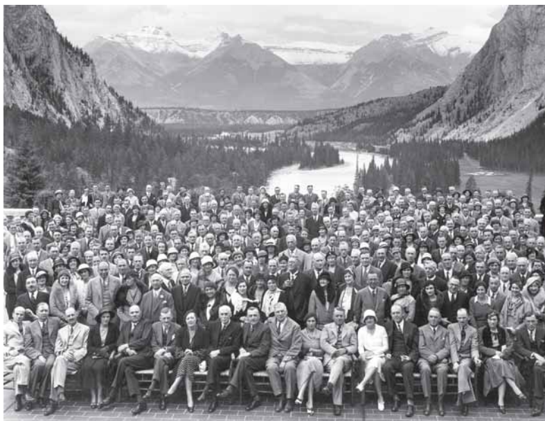
R.B. Bennett Luncheon Canadian Bar Association Conference Banff Springs Hotel, September 3, 1932 LASA Accession no. 2007034