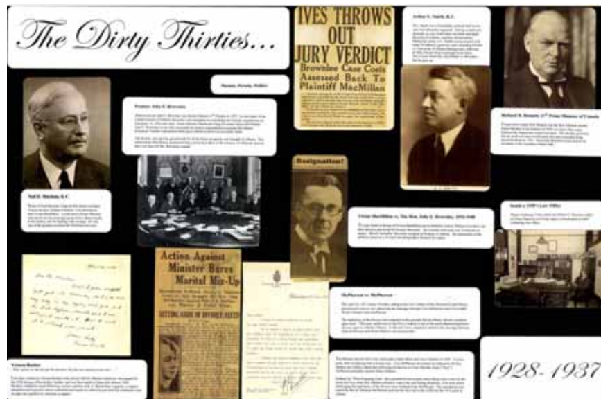
LASA Decades Display Board, 1928-1937 Featured at Law Society Gala Dinner, October 4 th , 2007