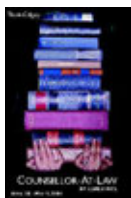
Poster for Counsellor-At-Law Theatre Calgary gala event

LASA participated in a gala event with Theatre Calgary on May 6, 2004. LASA sold tickets to the production of Counsellor-at-Law, and held a private pre-show reception which included a silent auction. The fundraising event raised $24,881 for operations.